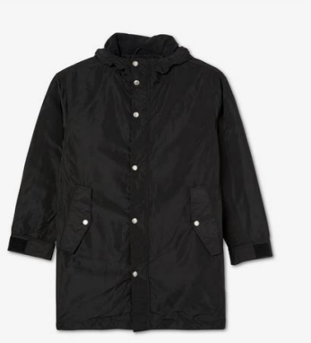
Fjallraven polar guide parka. Fjallraven polar guide.